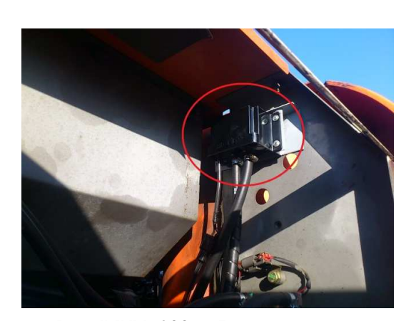
Install IKM-300 in Pump room

Reduce the maintainance cost by required fuel check for machine that by IKM-300 only.